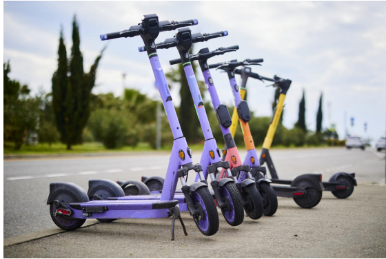
shared electric scooter

5 Read the user feedback on the two products below. Work with your partner to complete the conversation.